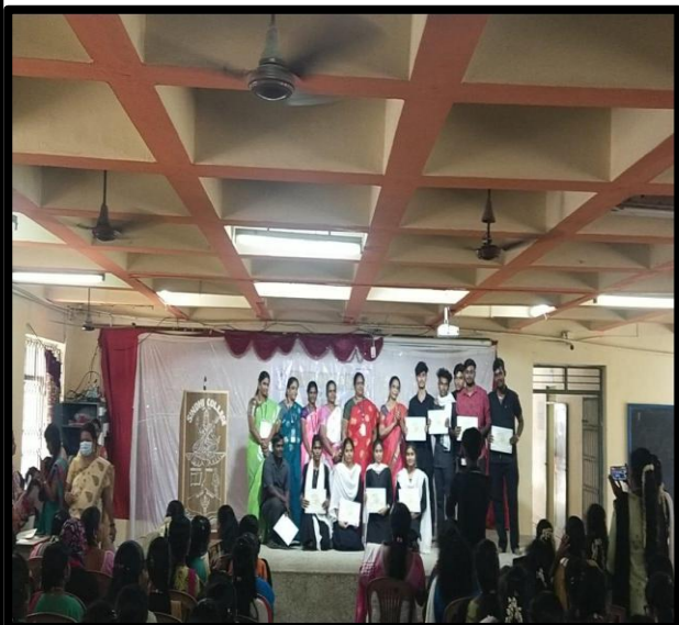
5. The Department of Social work organized a Seminar on the Topic on “Child Protection: Issues and Challenges on 14.03.2022