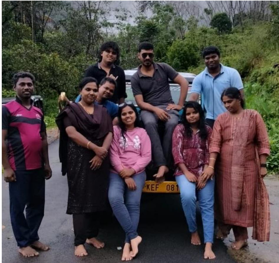
VISIT TO ADVENTURE PARK AT MUNNAR