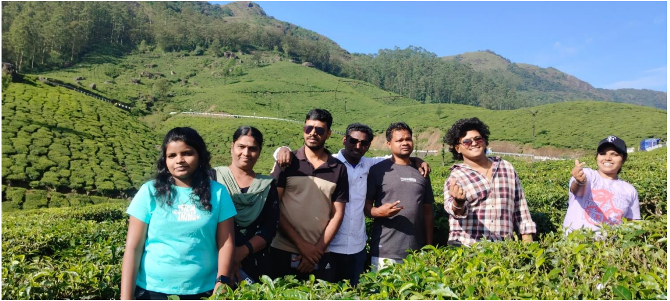
GROUP PHOTO OF STUDY TOUR TO KERALA