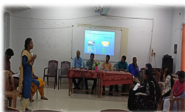
Paper Presentation Debate