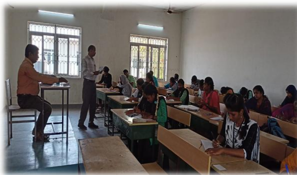
ADD Design Essay Writing