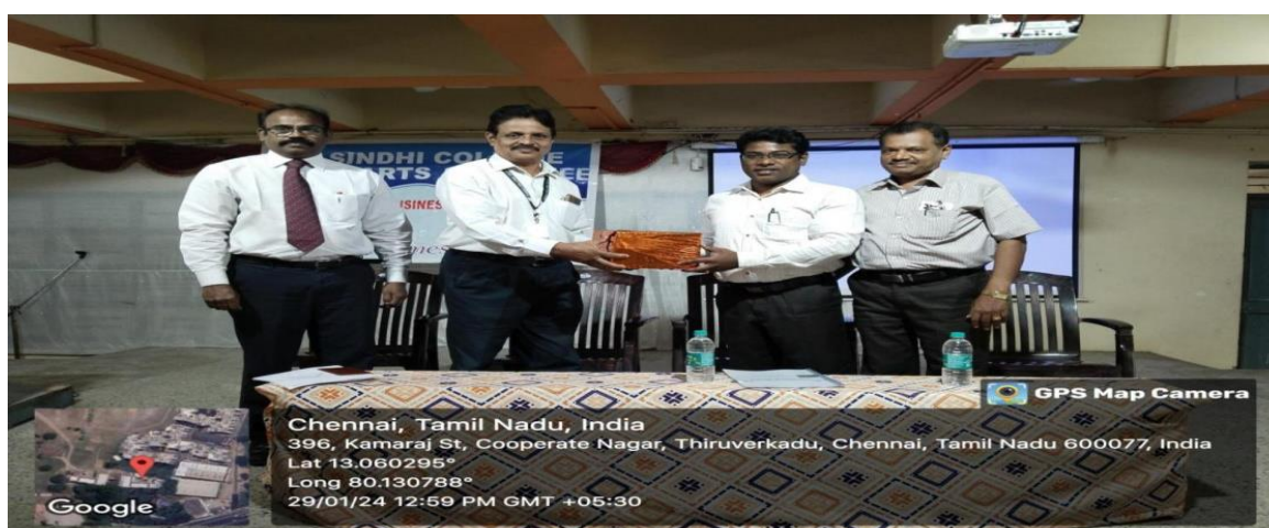
Principal Honouring the Guest with a Memento